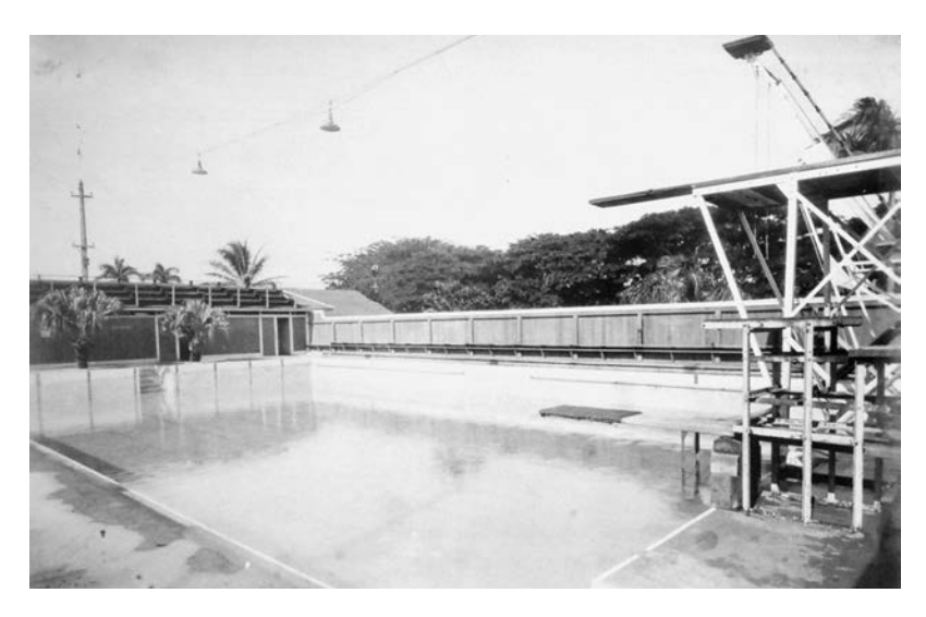
FIGURE 1. The Swimming Tank in Pu'unēnē, Maui (1925).

hoods. One or two pools would be built in black neighborhoods with the rest in white neighborhoods. African Americans who sought admission to pools earmarked for whites would be discouraged by white attendants, and were harassed and assaulted by white swimmers who enforced segregation through violence. Segregated recreational facilities also existed for many Asian Pacific Americans prior to World War II as they were denied access to white designated pools. Additionally, class contributed to racial segregation as poor working-class whites, blacks, and other immigrant groups were seen as dirty and prone to carry communicable diseases. As a result of these racial and class sentiments, the swimming pool in Pu'unēnē reflected prevailing national and local sentiment with the complete exclusion of ethnic working classes and their children.