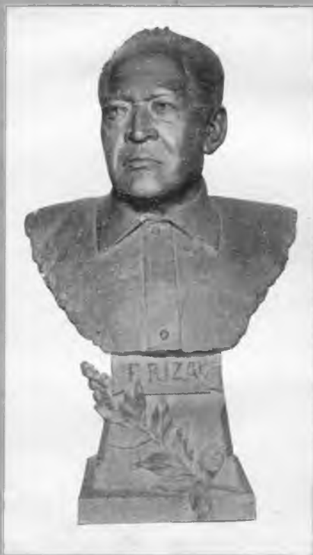
Dr. Rizal's Father