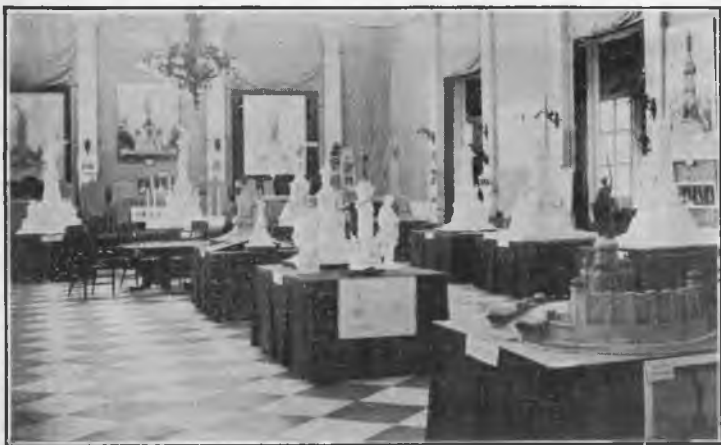
RIZAL MONUMENT MODELS IN THE GOVERNMENT PALACE MARBLE HALL. (The adopted model is under the chandelier.)

The man who works is a better patriot than the one who talks of the past and dreams of the future. The real reverence for Rizal is not shown in December 30th processions but in heeding his teachings and following his example from January 1st to December 31st, inclusive.