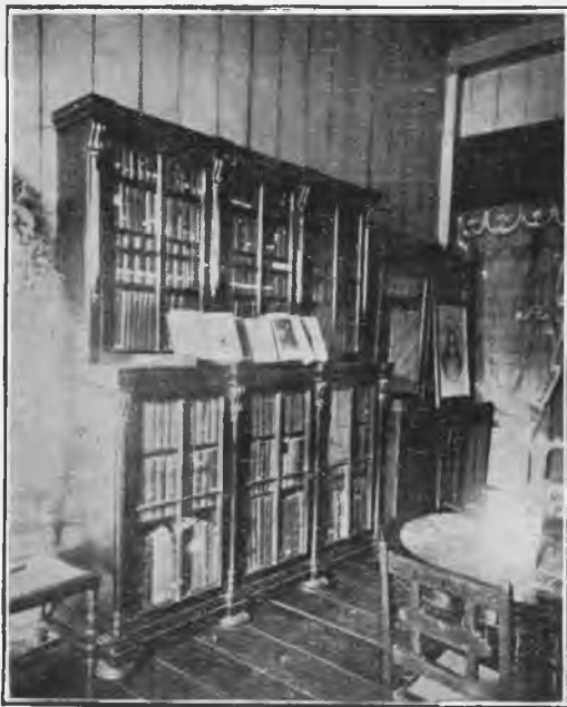
Dr. Rizal's Library

Another small case with those shown here makes the half remaining of his books. Of the open volumes first is Goethe's "Wilhelm Meister" in German, next Sue's "Wandering Jew" and the third a finely illustrated Spanish edition of "The Lives of the Presidents of the United States."