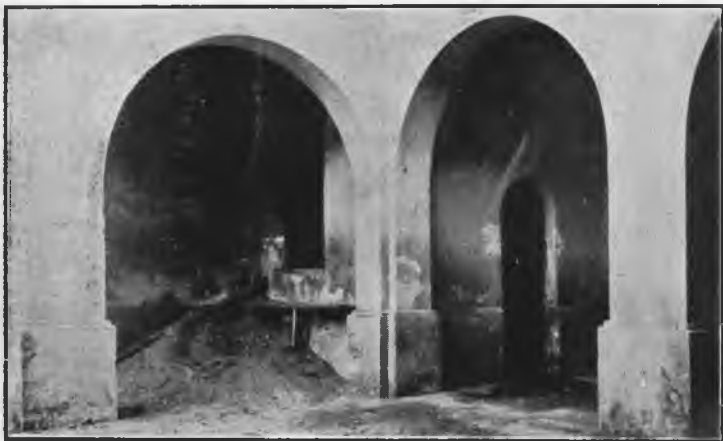
Rizal's Cell Fort Santiago

A retraction was required by the Archbishop before he could receive the consolations of his religion and several forms were proposed. Practically every victim of political persecution had left a retraction couched in such language that its spontaneousness was always questioned. The one dictated for Rizal was no exception and the Jesuits knew he would never sign it so they substituted a form of their own, giving what was essential for reconciliation with the Church and worded in a way that would not recall the differences Rizal had had with some of its minis-