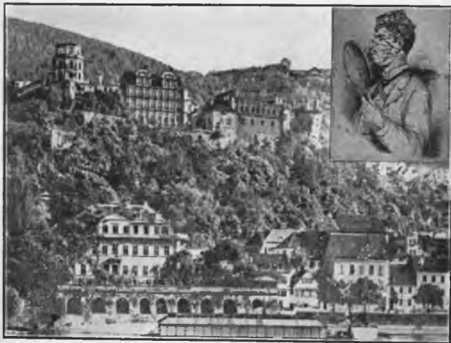
HEIDELBERG UNIVERSITY and a duel-scarred German student.

are evidently destined to bring to a full development the germs originated by the Spanish." With the great geographer he discussed the education and training needed to prepare his countrymen successfully to compete with an energetic, creative and progressive nation, for he recognized the justice of the criticism that his countrymen had dreamed away their best days.