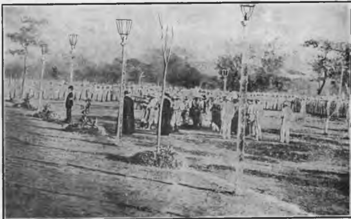
Rizal's Execution.

His widow joined the insurgents at Cavite, and later returned to Manila and then to Hong Kong where in 1898 she was married to a Filipino student from Cebu. She taught in the public schools of Manila in 1901, and in the following year died in Hong Kong and is buried there in