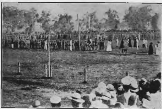
Before the shooting