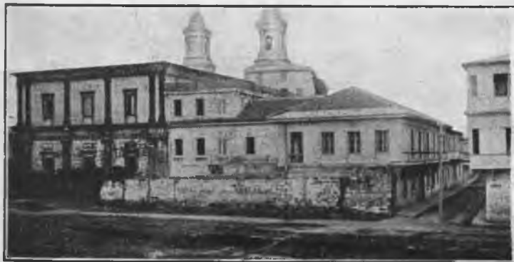
The Ateneo Municipal

With the following year, when he entered the Ateneo Municipal, his real schooling began. This school, whose semi-centennial is to be celebrated in 1909 and which has educated the greater part of the leading men of the Philippines of today, had been founded by the Jesuits upon their return to the Islands after nearly a century of banishment. In methods of instruction it was in 1872 the only modern school in Manila, but it was particularly because Filipinos were given the same treatment there as Spaniards that the school was so popular. Hundreds were going as day scholars awaiting a vacancy in the dormitory that they might enjoy the advantages of a boarder. It was not until his fourth year that José's opportunity came.