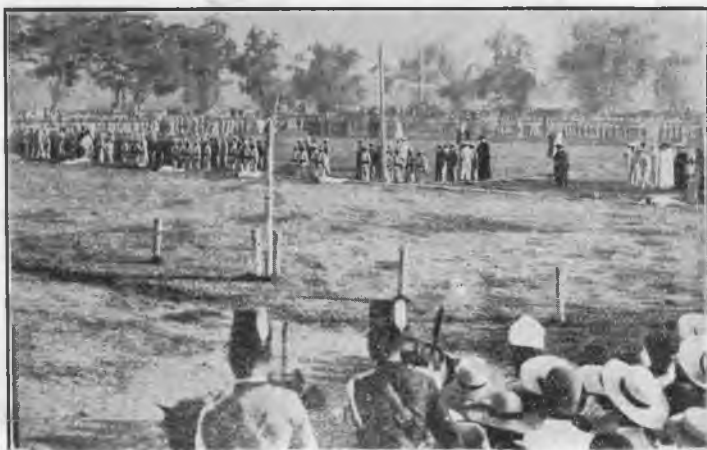
After the shooting

Execution of Liga Filipina Members, Bagumbayan Field, January 11th, 1897.