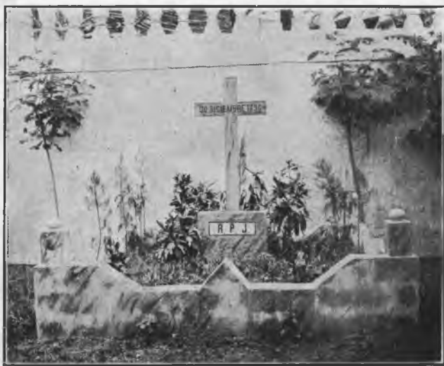
Former Grave of Dr. Rizal

A new province bears Doctor Rizal's name, his picture appears upon the most generally used values of postage stamps and paper money, every town in the Philippines has its Rizal Street or Rizal Square, Manila has a flourishing Rizal University, a Rizal Ateneo and a Rizal Business College, and his birthday is getting to be observed as well as the day of his death, but Filipinos are forget-