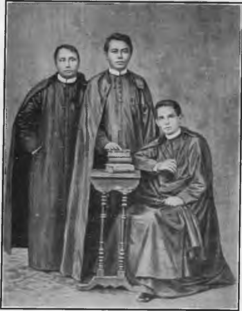
“To the memory of the priests, Don MARIANO GOMEZ (aged 85 years) Don JOSE BURGOS (aged 30 years) and Don JACINTO ZAMORA (aged 35 years) Executed on Bagumbayan Field