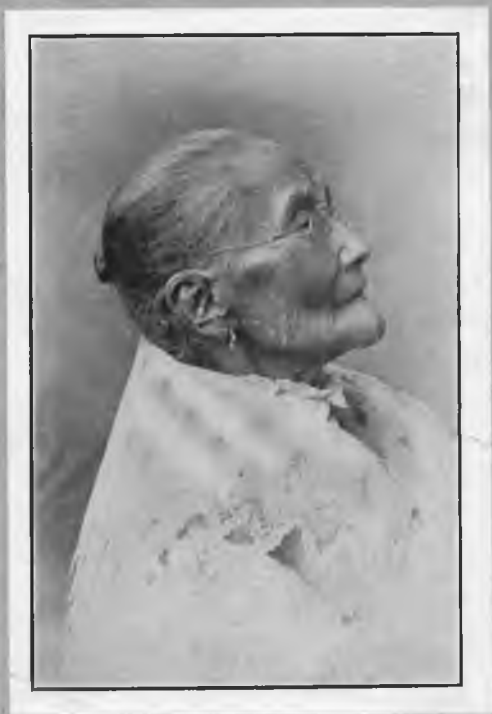
Dr. Rizal's Mother at 80

reading supplemented the more modern methods of the Jesuit schooling and prepared him for education abroad so that he seems to have entered into the spirit of free institutions and talks of liberty with a realization of its responsibilities that is absent from the beautiful dreams of most writers of Latin countries. Could the magic of his name cause the Spanish-trained generation of Filipinos to study and heed the lessons he prepared for them these Islands might enjoy without delay that prosperity and