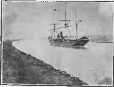
RIZAL'S SHIP IN THE SUEZ CANAL